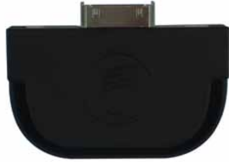
Adapter kit available for iPod touch, iPhone 4, iPhone 3GS, iPhone 3G, iPad 2 and iPad